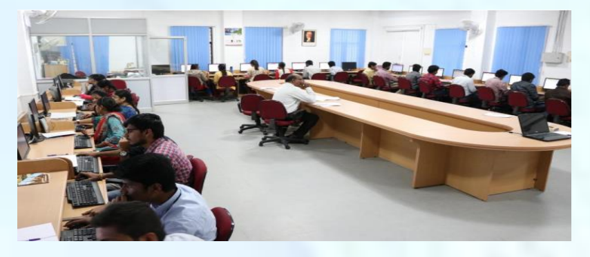
Interactive sessions with Industry experts