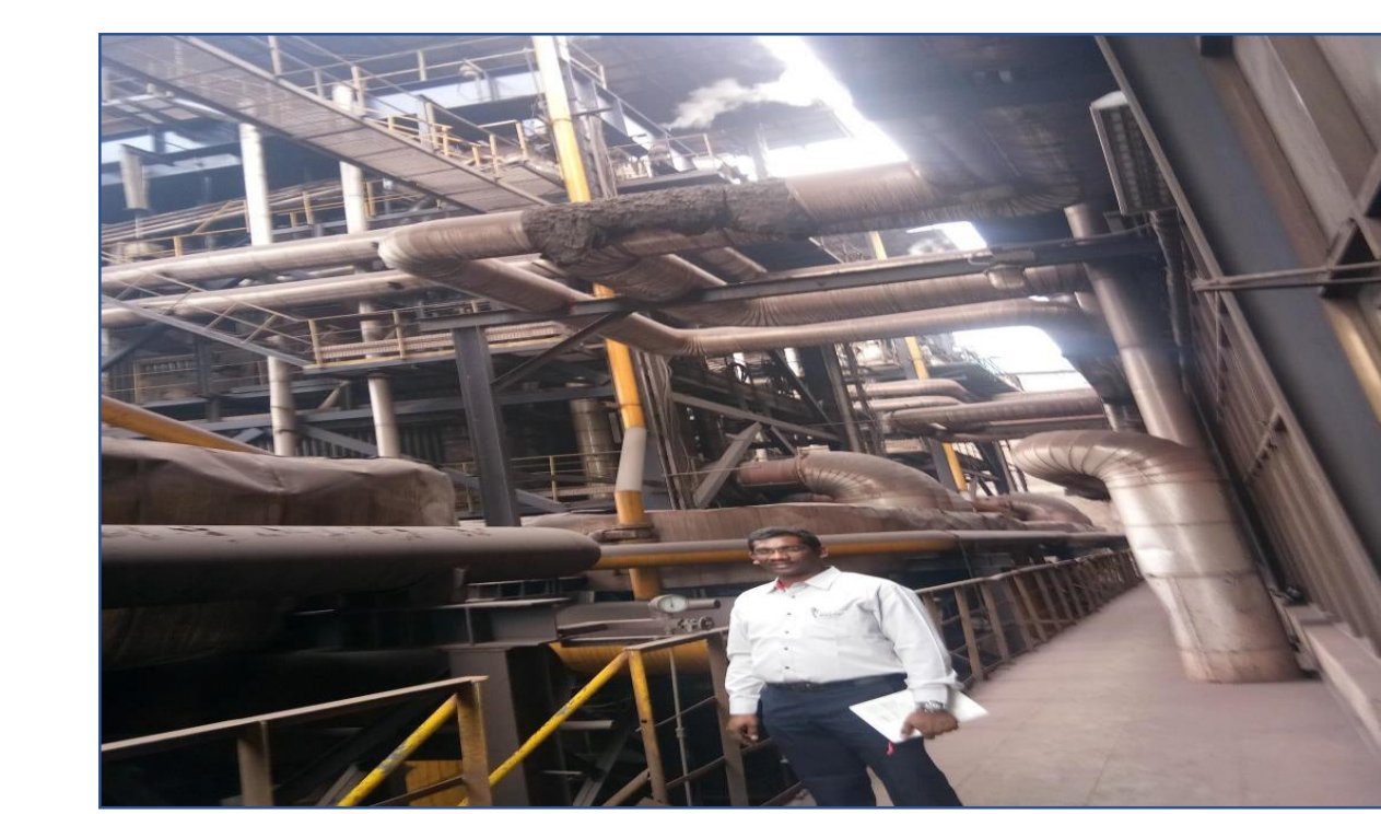
Student Internship at Industry