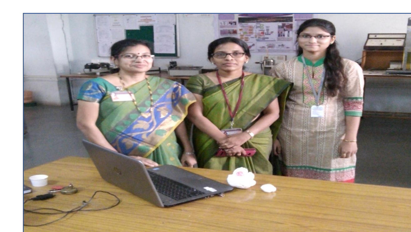
Brain Tumor Prosthetics using 3D printing technology