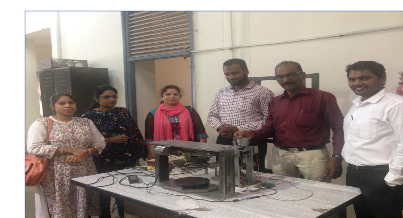
Patented Project An Apparatus for Making A Flat Edible Food