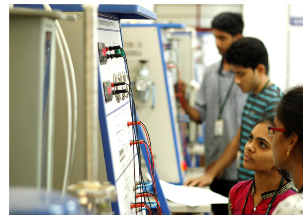
Industrial Process Control Systems Lab