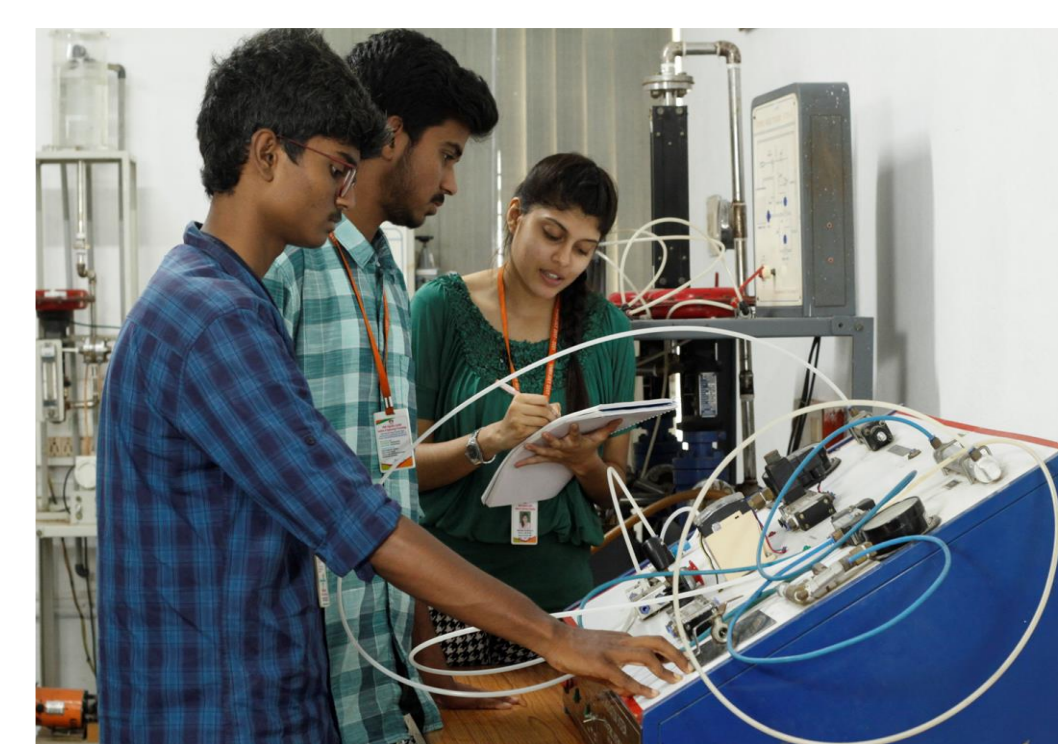
Process Control Instrumentation Lab