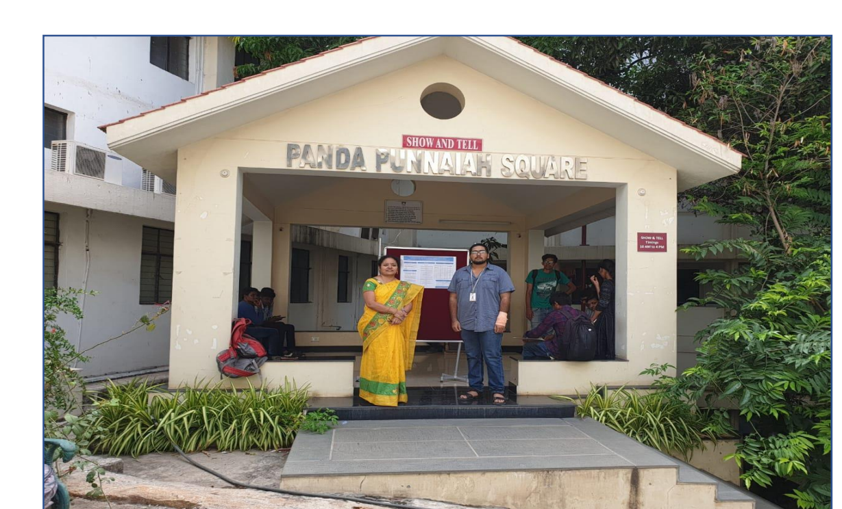
Student Industry Internship Project Display at Show & Tell