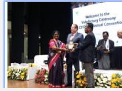
CSI Best Accredited Student Branch Award during CSI 2020 Annual Convention