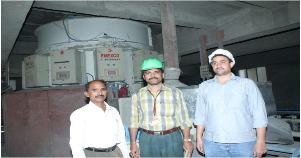
(c) As Lab Incharge/Metrology Lab/MED :