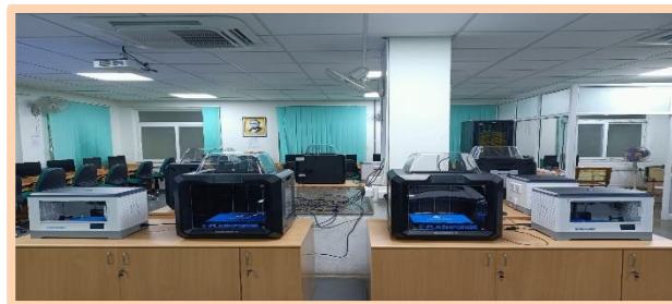
3D Printing Laboratory