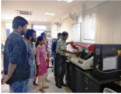
ADVANCED CAM LAB