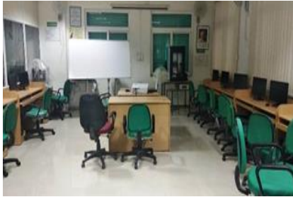
ADVANCED CAD LAB