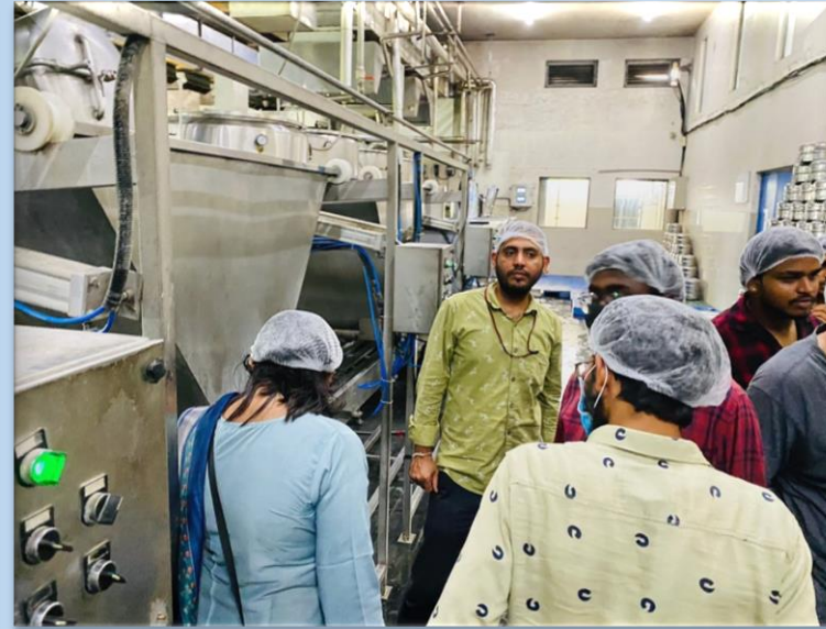
II B. Tech (ME-II) Students industrial visit of Akshaya Patra Foundation