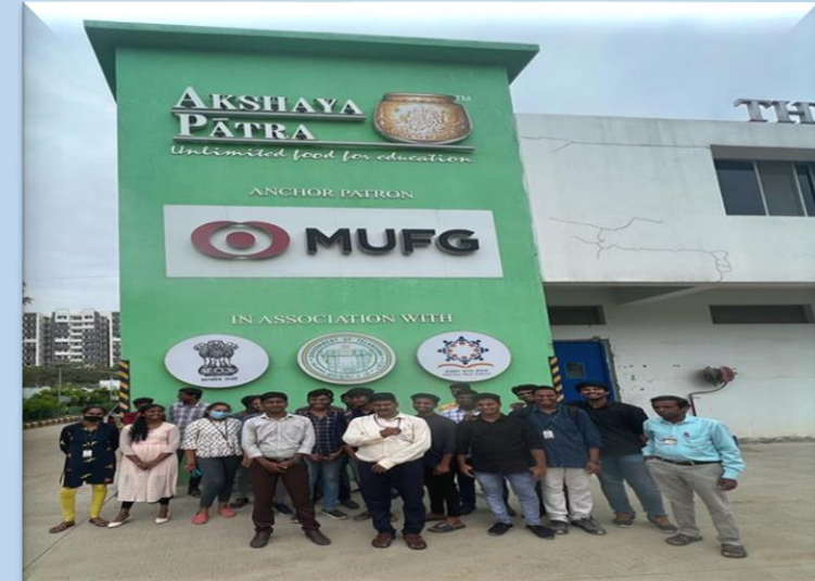
II B. Tech (ME-I) Students industrial visit of Akshaya Patra Foundation