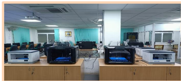
3D Printing Laboratory