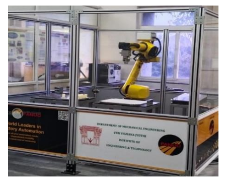
AUTOMATION & ROBOTICS LAB