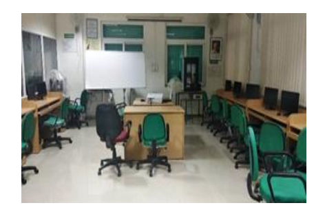
ADVACED CAD LAB