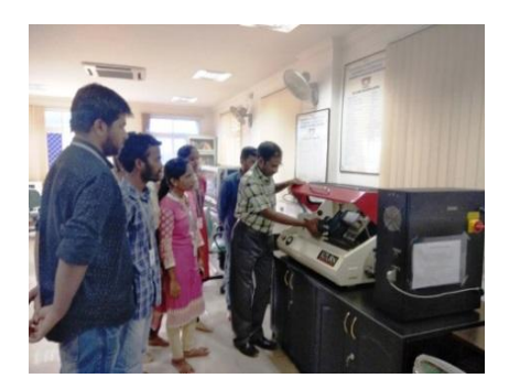
ADVANCED CAM LAB