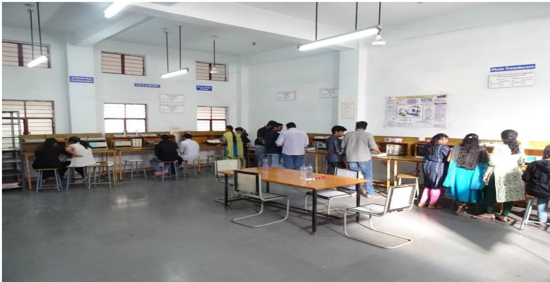
Figure 6. Sensors and Measurement Laboratory