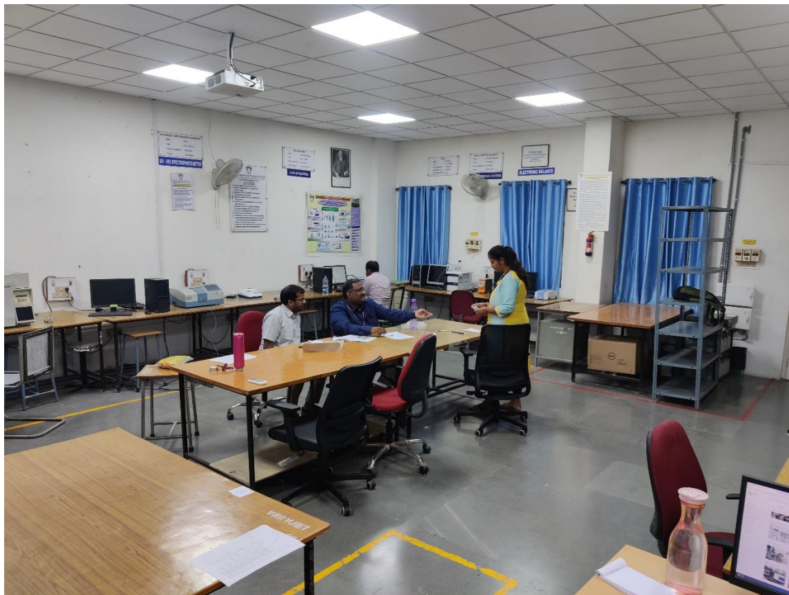
Figure 7. Analytical Instrumentation Laboratory