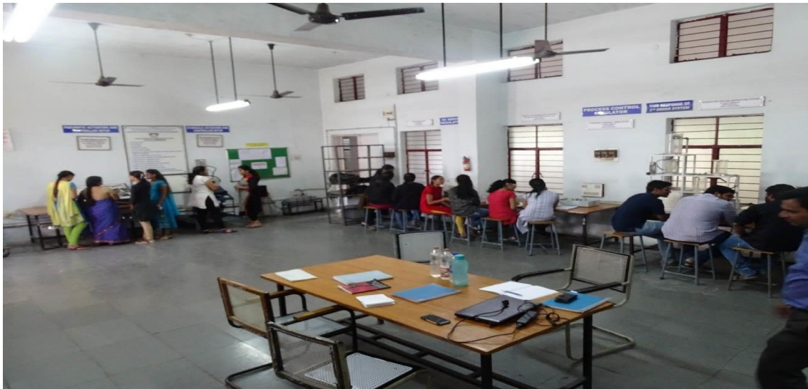
Figure 5. Process Control Instrumentation Laboratory