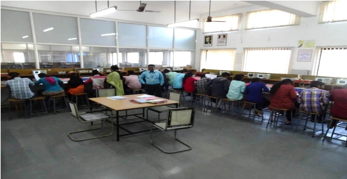
Figure 2. Electronic Circuits Laboratory