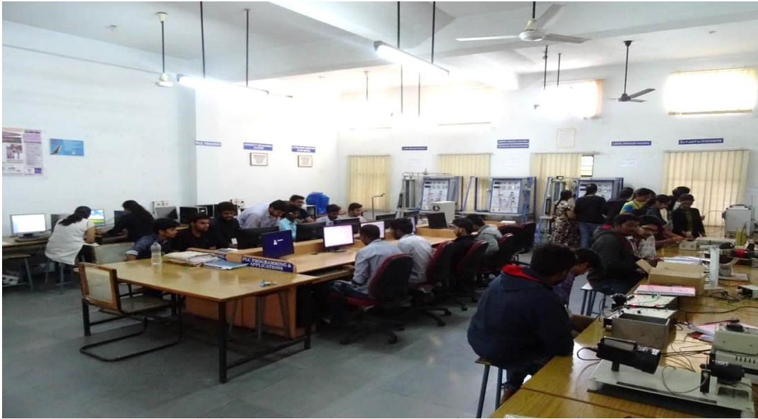
Figure 4. Process Control Automation Laboratory