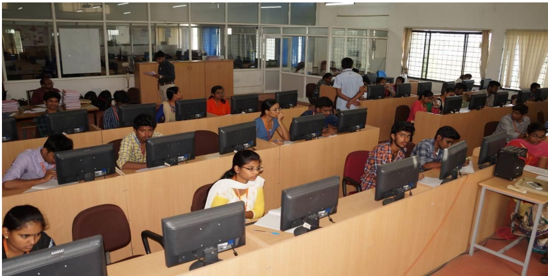
Figure 1. Basic Simulation Laboratory