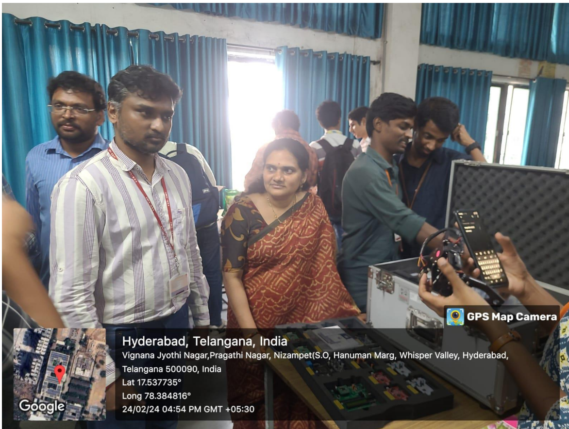
Figure 8. Robotics Laboratory