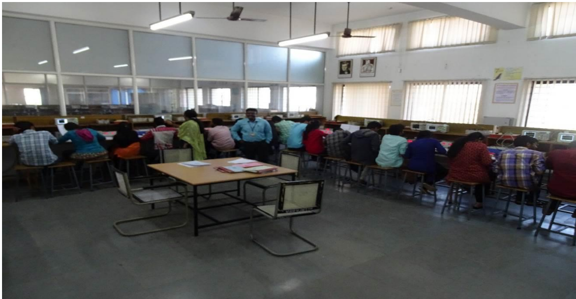
Figure 2. Electronic Circuits Laboratory