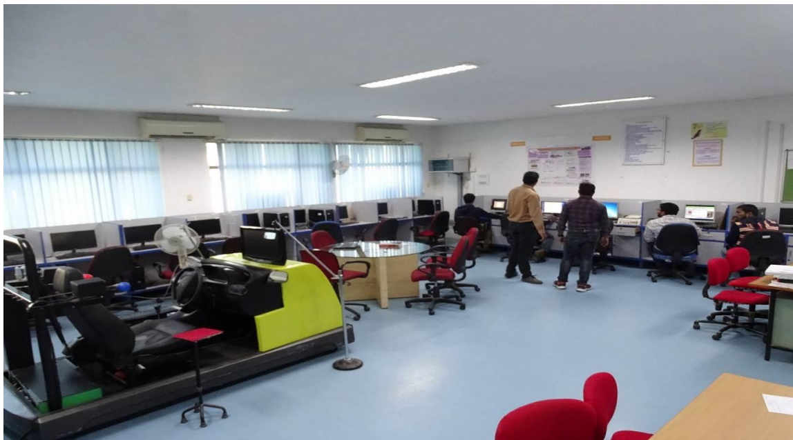
Figure 7. Virtual Instrumentation Laboratory