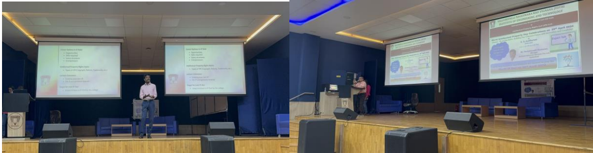
World Intellectual Property Day - 2024 (World IP Day - 2024) with a theme of “ IP and the SDGs: Building Our Common Future with Innovation and Creativity ”