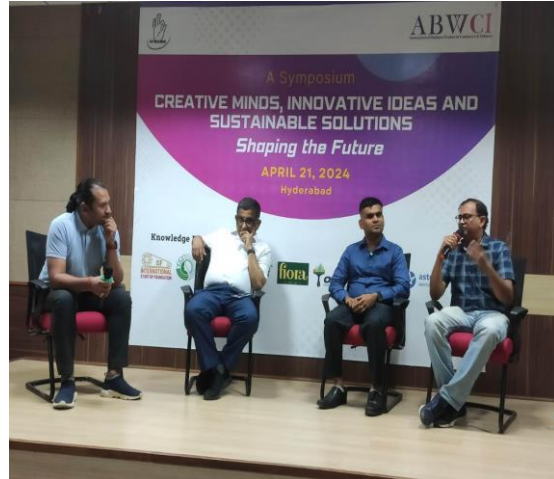
A symposium on "Creative Minds, Innovative Ideas, Sustainable Solution" organized by Association of Business Women in Commerce & Industry (ABWC) at NI-MSME, Hyderabad on 21.04.2024