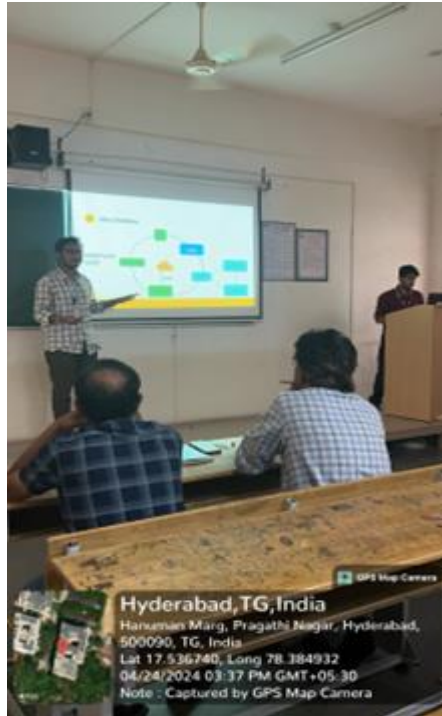
ED Cell has organized the My Big Idea Competition on 24.04.2024