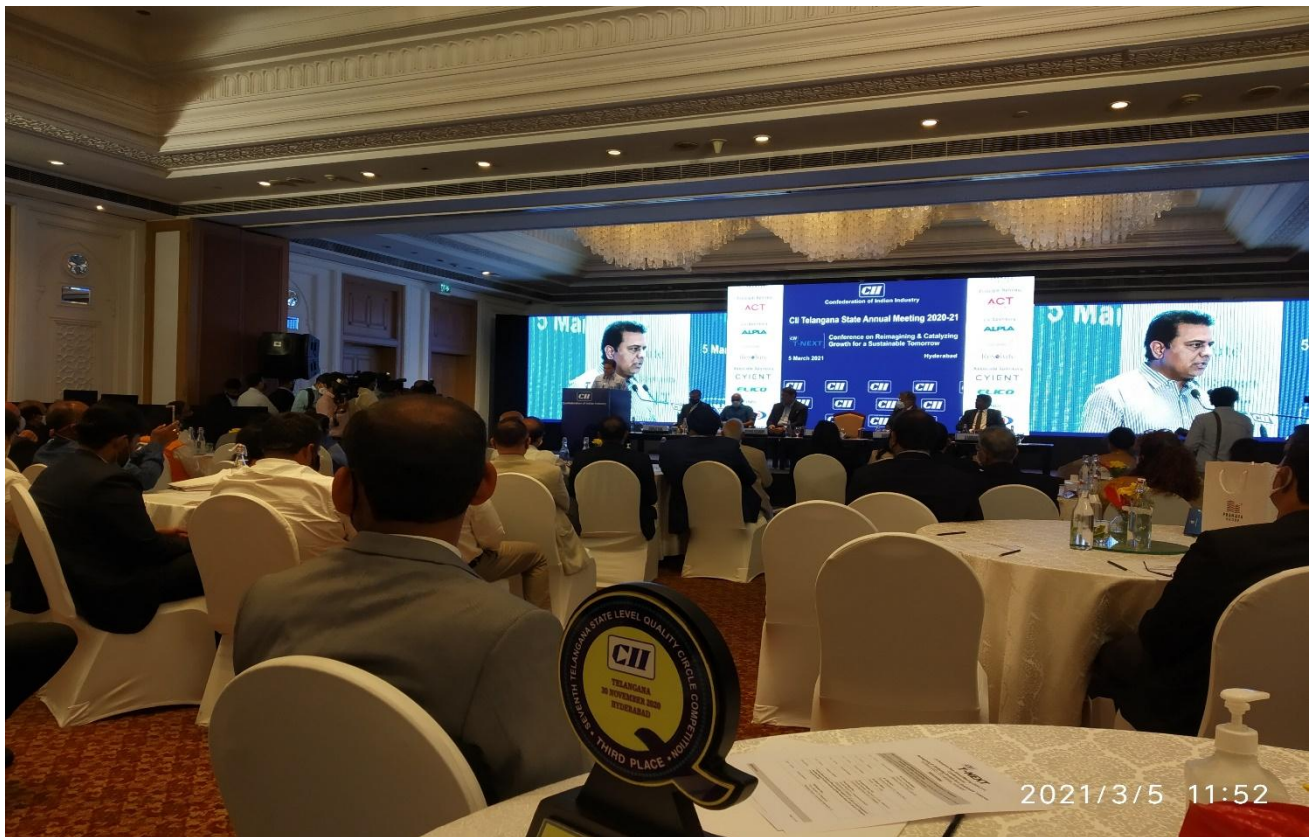
CII Telangana State Annual Meeting / Session on 05/03/2021 at Hotel ITC Kakatiya, Hyderabad