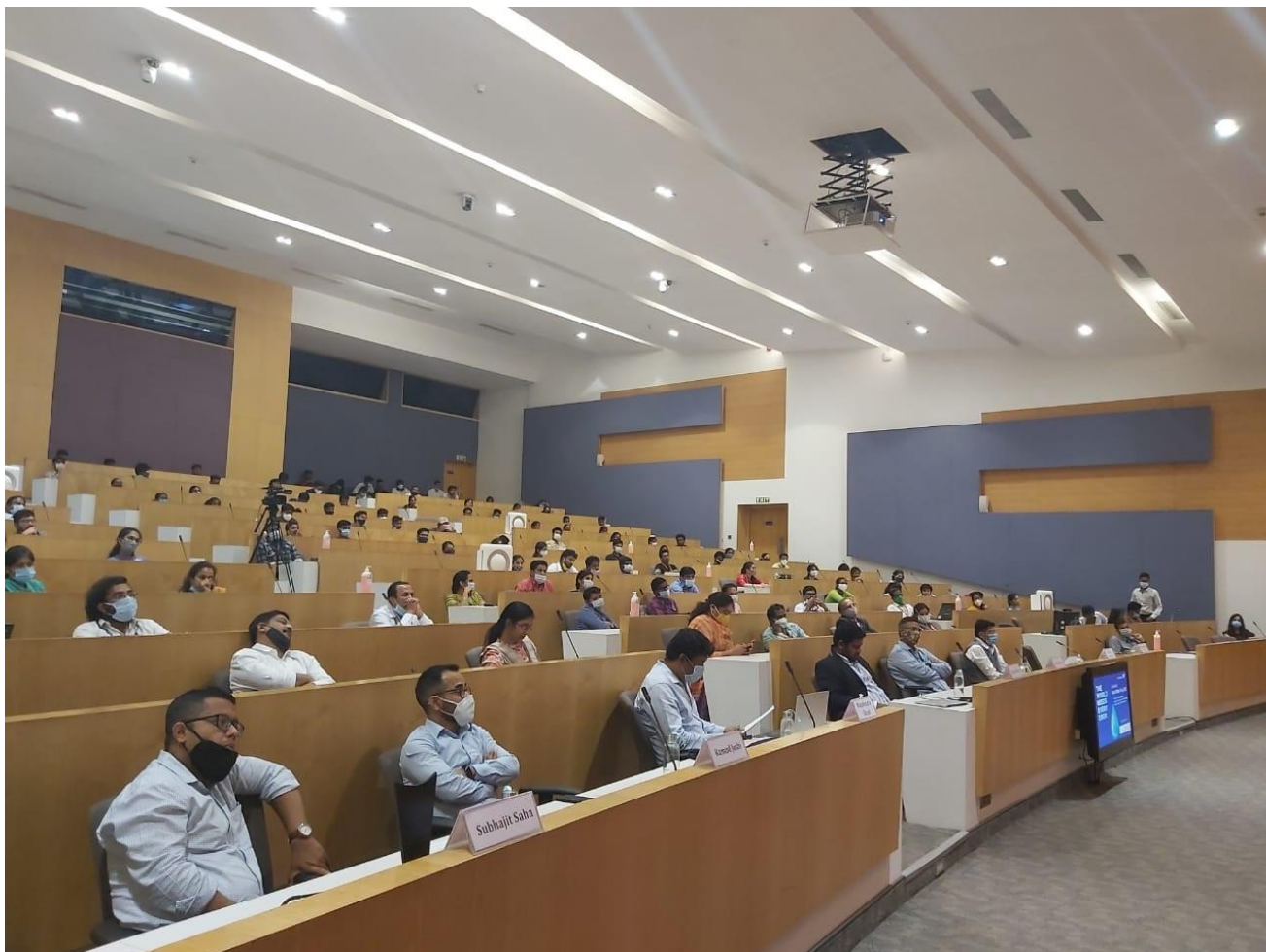
World Water Day 2021 celebrations at DRL(Dr Reddy's Laboratories Ltd) Leadership Academy, Bachupally, Hyderabad.