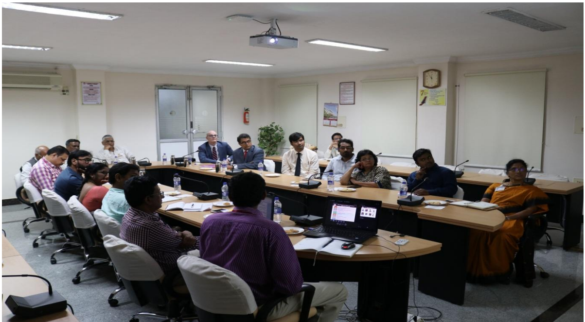
Interaction with Northeastern University IDEA program delegates by the representatives of VNRVJiet at Board Room on 18-12-2019.