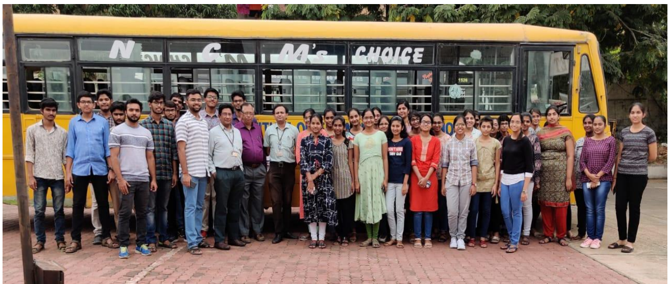
VNRVJIET students and faculty visit to IIIF-2019, NSIC, Hyderabad.