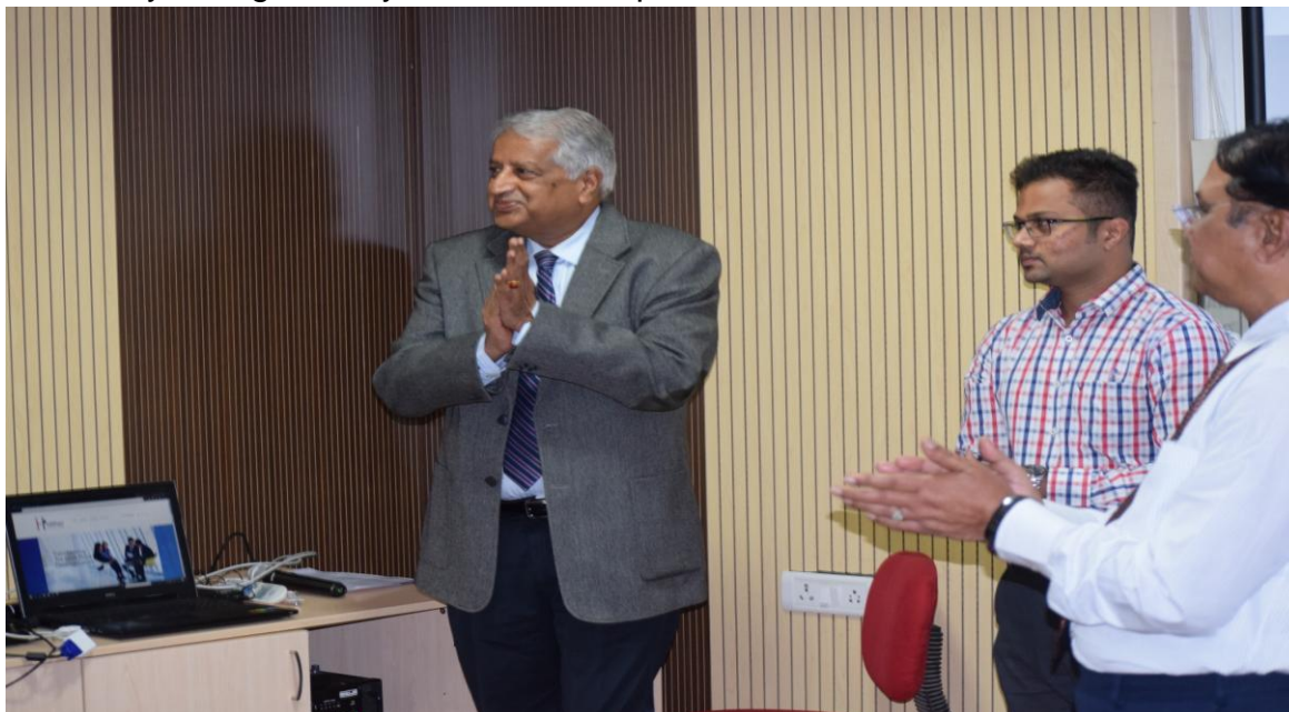
"Startup Trio" website launching by President and Secretary of Vignana Jyothi on 23-09-2017 during Alumni Entrepreneurs Meet-2K17.