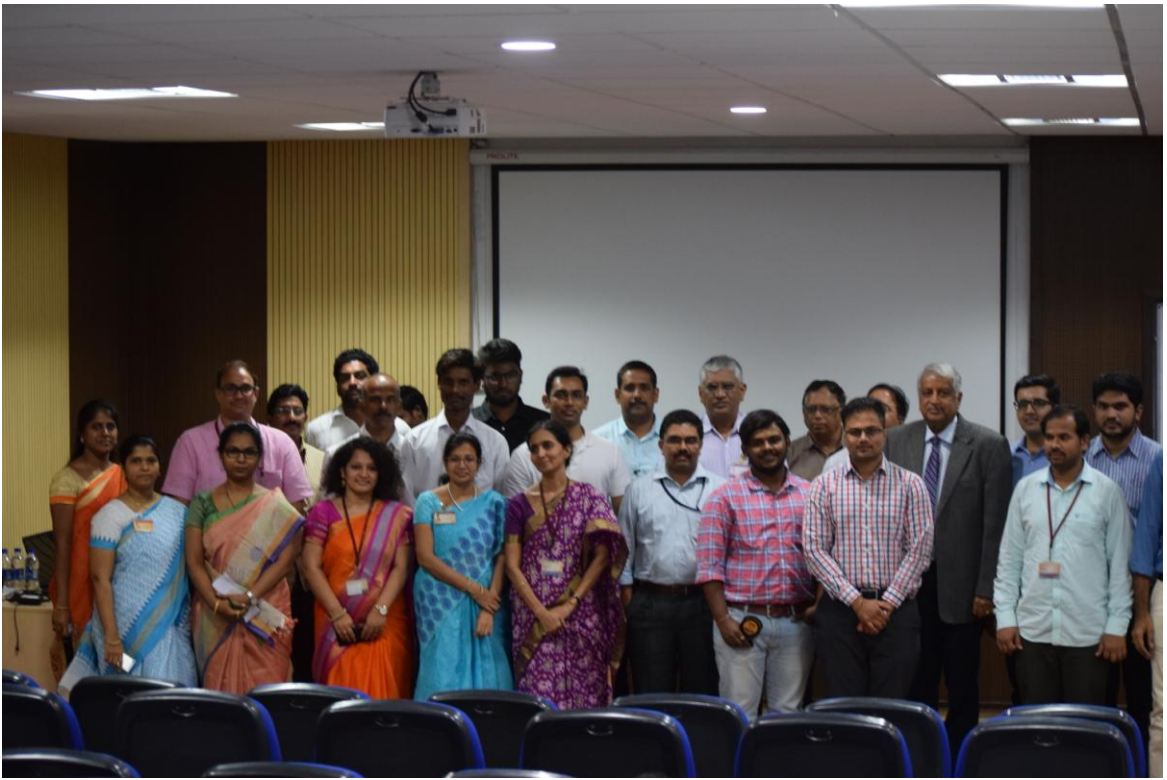
A group photo of Faculty Members, President, General Secretary of Vignana Jyothi and Principal along with Alumni Entrepreneurs on 23-09-2017.