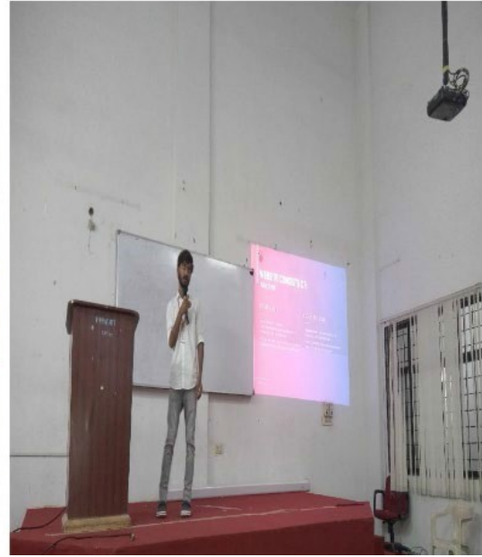
My Big Idea (MBIC) Presentations at PG Block Seminar Hall on 16-08-2022