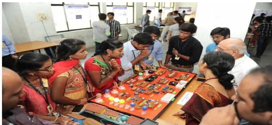
A Proto Type is being displayed during Open House