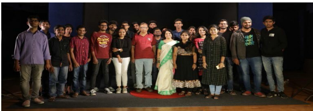
Josh Talks Team and Student Volunteers of VNRVJIET at K.S.Auditorium on 15-09-2019

Josh Talks runs the largest network of non-entertainment channels on YouTube. Through 18 active channels, it showcases inspiring stories from the grassroots of India and offer critical financial and career-related information to our audience. VNRVJIET has entered a venue partnership agreement with Josh Talks and recorded 19 video lectures on You Tube in K.S. Auditorium on 15-09-2019 during 8 AM to 9 PM.