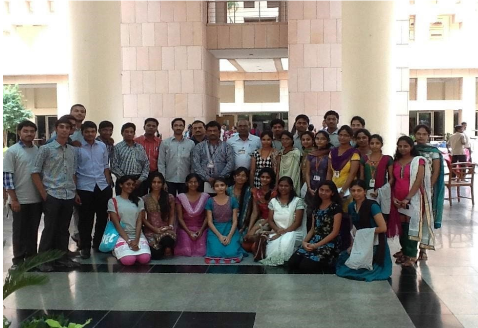
First Batch students of TEP at ISB, Hyderabad.