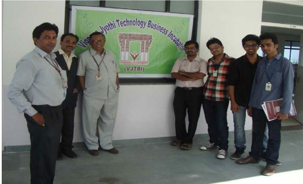
Inauguration of VJTBI at VNRVJIET