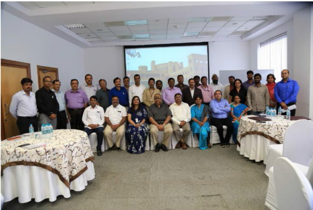
Principals, Directors and other representatives of different colleges in Telangana and AP States during Curtain raiser event of TEP/ ISB Version-2 on 14/05/2018 at ISB, Hyderabad.