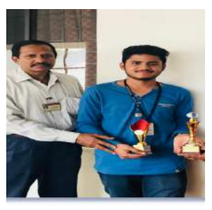
Chess Winner: National Level Sports Fest-2018-19

" Never stop chasing your dreams, it can take you from zero to hero in a fraction of time "