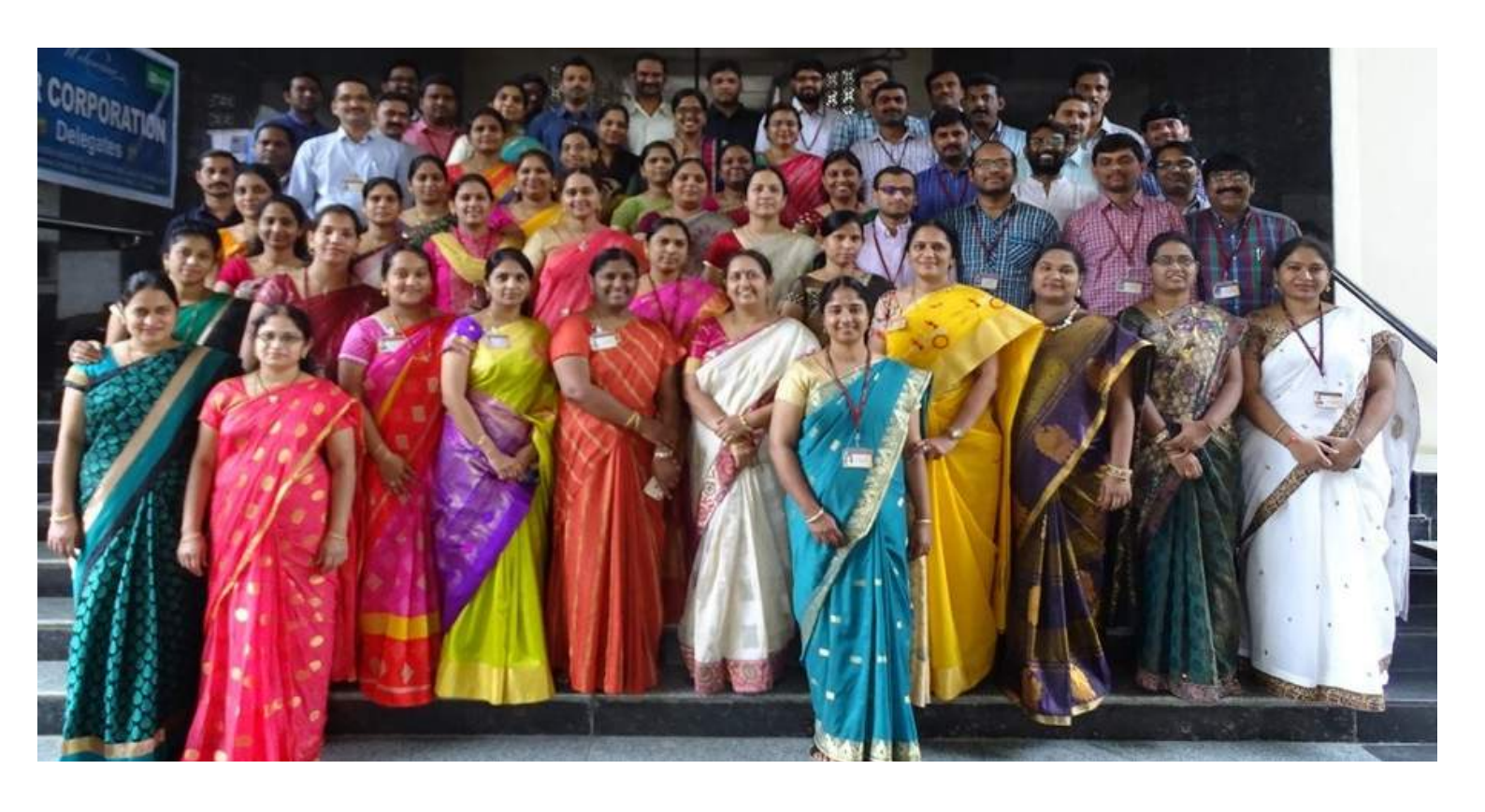
DEPARTMENT OF CSE