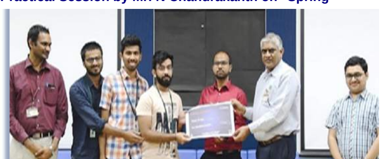
First Prize Winners of Turing Cup 2K19 from VNRVJIET-2019