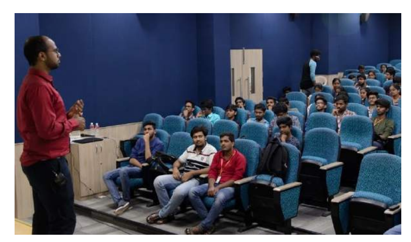
Workshop on Building Chat Bot using RASA