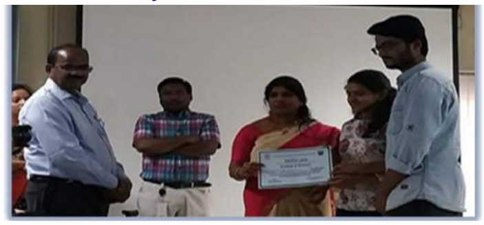
II Year Students Won First and Second Prize in OUEST 2019 at JNTUH