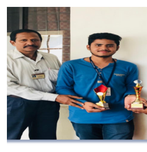
Chess Winner: National Level Sports Fest-2018-19

" Never stop chasing your dreams, it can take you from zero to hero in a fraction of time "