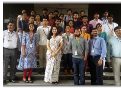
NCR Corporation Team with Selects -2019 Batch