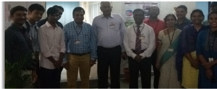
Microsoft selected students with 10.87 LPA-2019 Batch