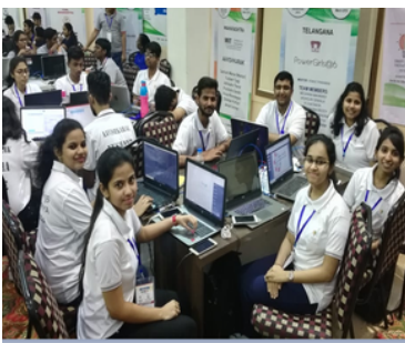
Students participating in Grand Finale of "SMART INDIA HACKATHON-2019" in Bhubaneswar