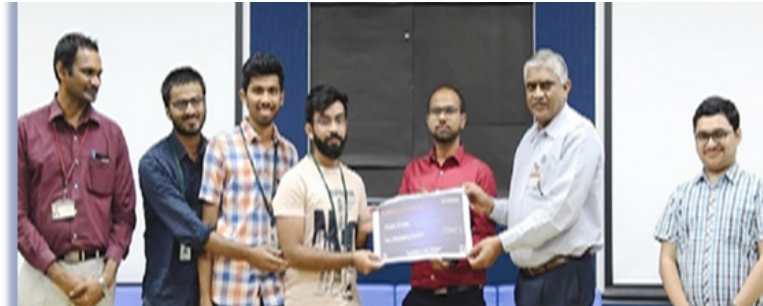
First Prize Winners of Turing Cup 2K19 from VNRVJiet-2019