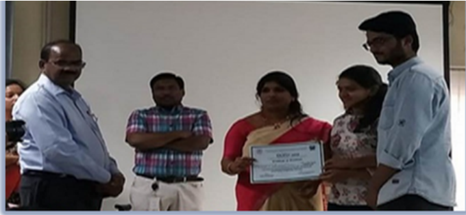
II Year Students Won First and Second Prize in QUEST 2019 at JNTUH