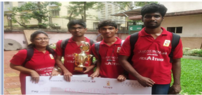
Team ENLIGHTENERS (II year) won cash prize of 50,000 in AI Hackathon at VESIT Mumbai-2019