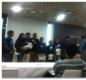
JPMC Code for Good Event Winners-2019 Batch