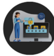
5. Information Security Officer