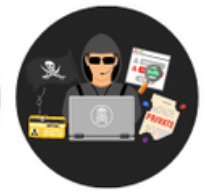
7. Ethical Hacker