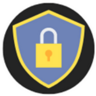
1. Cybersecurity Engineer / Analyst