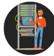
6. Network Engineer