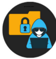
4. Security Manager