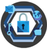
2. Cybersecurity Manager