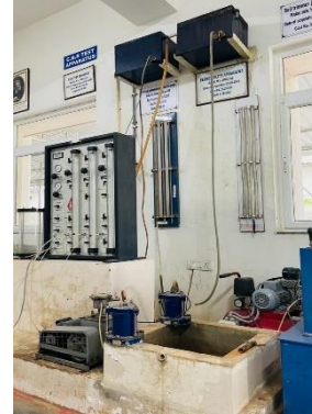
Unconfined Compressive Strength Apparatus