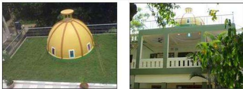
Dome, cast on the upper floor of FaL-G Mansion, Visakhapatnam, in Jan 2010

Transition zone is the interface between coarse aggregate and cement paste. Generally concrete do fail at transition zone, when subjected to stress, because of adverse effects caused by differential thermal stresses and weak crystallography at this zone. When OPC is used, belching out high surplus lime at early ages, such surplus lime gets dissolved in water tending to settle at transition zone. In high performance concretes aggregate size is rationalised in order to minimise differential stresses at transition zone, upon which the strengths are attributable to the strength of cement matrix associated with sand. In NAC, first of all, there is no scope for transition zone for having avoided coarse aggregate. Even the inert fly ash particles do develop cohesive bond with cement matrix making the ultimate NAC-matrix close to monolithic. This is manifested in NAC by high strength (55-70 MPa) and lowest permeability at 27 coulombs.