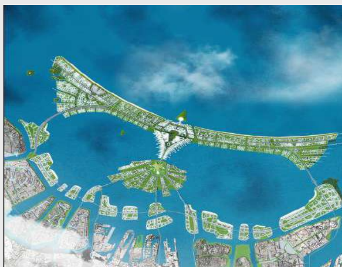
$40 Billion to Save Jakarta: The Story of the Great Garuda

In recent decades, a broader 'ecological turn' in engineering has emerged in Western Europe and North America, particularly regarding flood mitigation. This approach advocates for planning with nature rather than controlling it, moving away from traditional reliance on hydraulic engineering and 'hard' infrastructure towards experimenting with 'softer' flood mitigation techniques, such as restoring mangrove forests to protect coastlines against storm surges and tides.