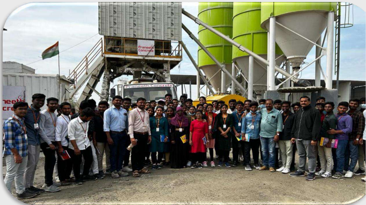
II B.Tech. Students at Industrial Visits –Praneeth Innovatives LLP