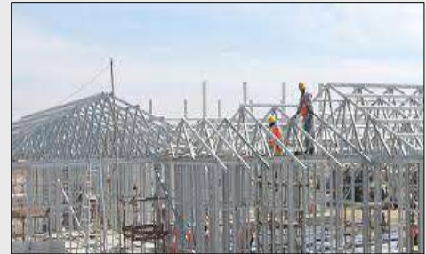
Fig:8 Light Gauge Steel Framing

Advantages: Durable, lightweight, recyclable.