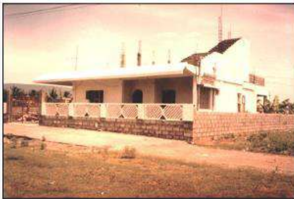
FaL-G Mansion 1991-slab with FaL-G concrete in lime route without using even a gram of cement

The urge to use complementary cement materials out of industrial wastes and thrust to conserve natural materials have given rise to NAC. As popularly known in building material research, the inventors developed FaL-G technology in 1989 introducing FaL-G as the cementitious material by using all the inputs, fly ash, lime and gypsum out of industrial byproducts.