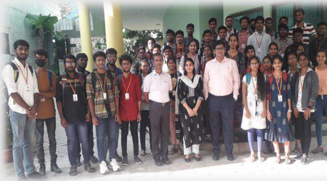
II B.Tech. Students at Industrial Visits – CII - Sohrabji Godrej Green Business Centre