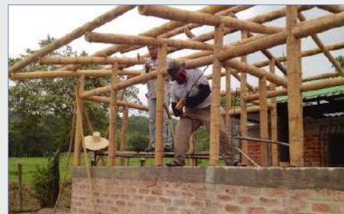
Fig:4 Bamboo Construction

Advantages: Cost-effective, quick construction, recycling.