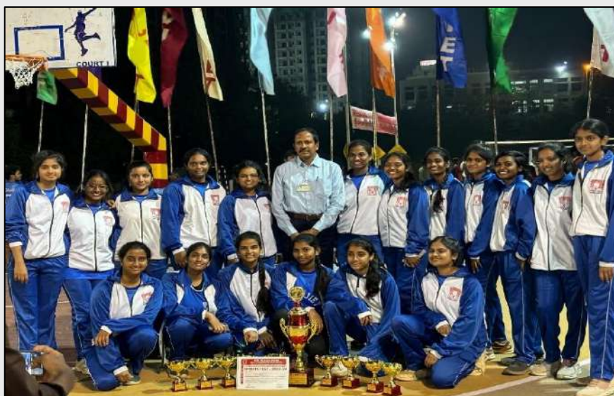
Throwball Women's Team Winners