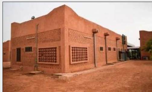
Fig:3 Compressed Earth Blocks