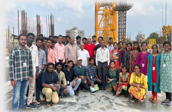
III B.Tech. Students at Industrial Visits – M/s. Shangrila Infracon India Pvt Ltd