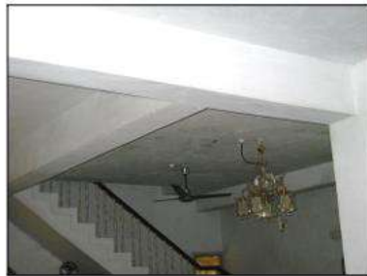
Tie beams in FaL-G concrete slab

To prove its efficacy, they did cast 2000 sft of slab way back in 1991 for their house that consists of 15-18 ft long beams, where a couple of them are tie beams too. This has helped to demonstrate the potential of FaL-G as structural cement and inspiring confidence to its use for bricks and blocks. In their further studies for optimizing FaL-G they developed various mixes using 4th generation admixtures in result of which they encountered with a mix showing up absolute workability, compaction, and cohesiveness, all at 0.15 WCF (factor of Water/cementitious material) with grade strengths of 55 MPa to 65 MPa.