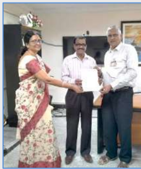
MoU with M/s Keerthi Industries