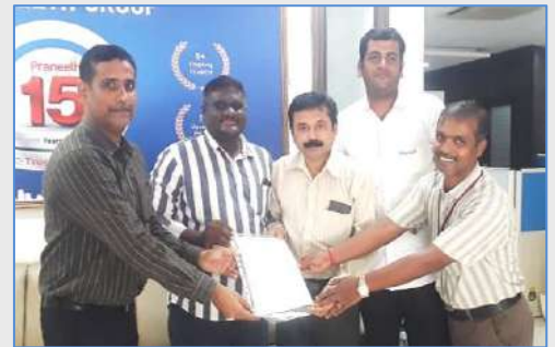
MoU with M/s Praneeth Group