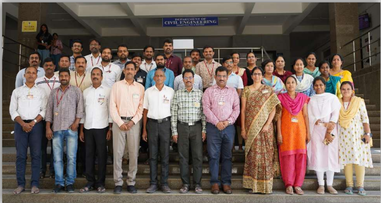
FACULTY OF CIVIL ENGINEERING DEPARTMENT