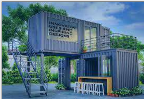
Fig:5 Shipping Container Architecture

Advantages: Fast growth, low cost, eco-friendly.