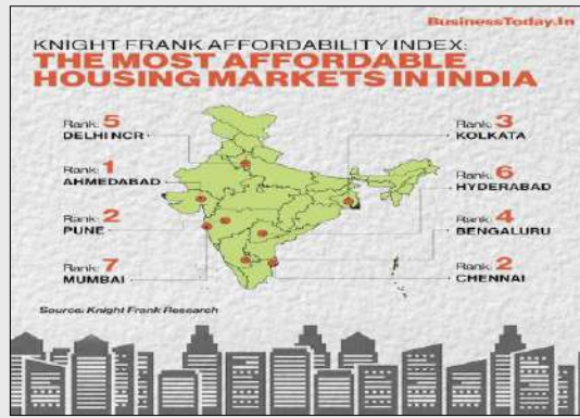
Fig:1 Map showing Housing Market in India