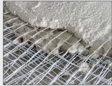
Fig:7 Ferrocement Technology

Advantages: Cost-effective, earthquake-resistant, durable.