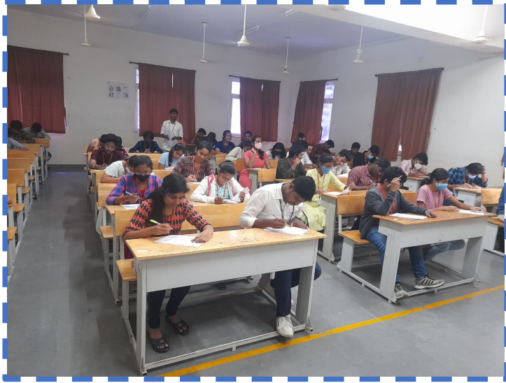
Students participating in Quiz on the eve of Engineer's Day