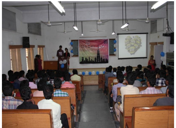
ICI Activities organized in Civil Engineering Department