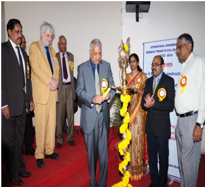
Dignitaries Lightening the lamp

A Report on International Conference on “Emerging Trends in Civil Engineering” (ICETCE-2014) 6 th - 8 th January 2014 under TEQIP – II