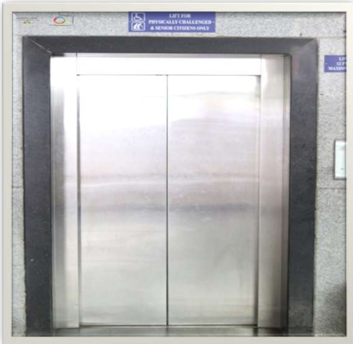
3 Lifts Yogiaiah Naidu Bhavan (CE, ME and AE) – D Block