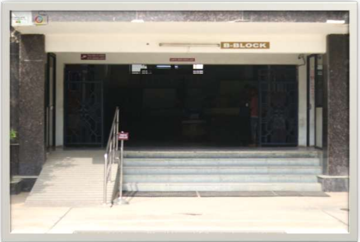
Ramp & Rail in Patrons Bhavan – B Block