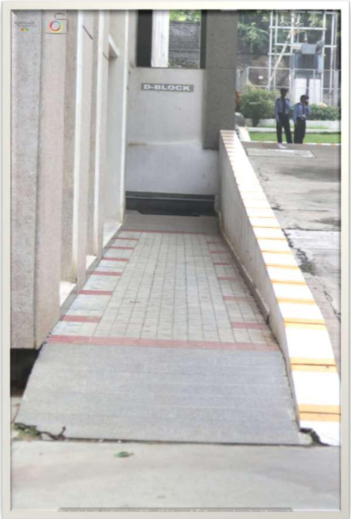
Ramp & Rail in Yogaiah Naidu Bhavan (CE, ME and AE) – D Block