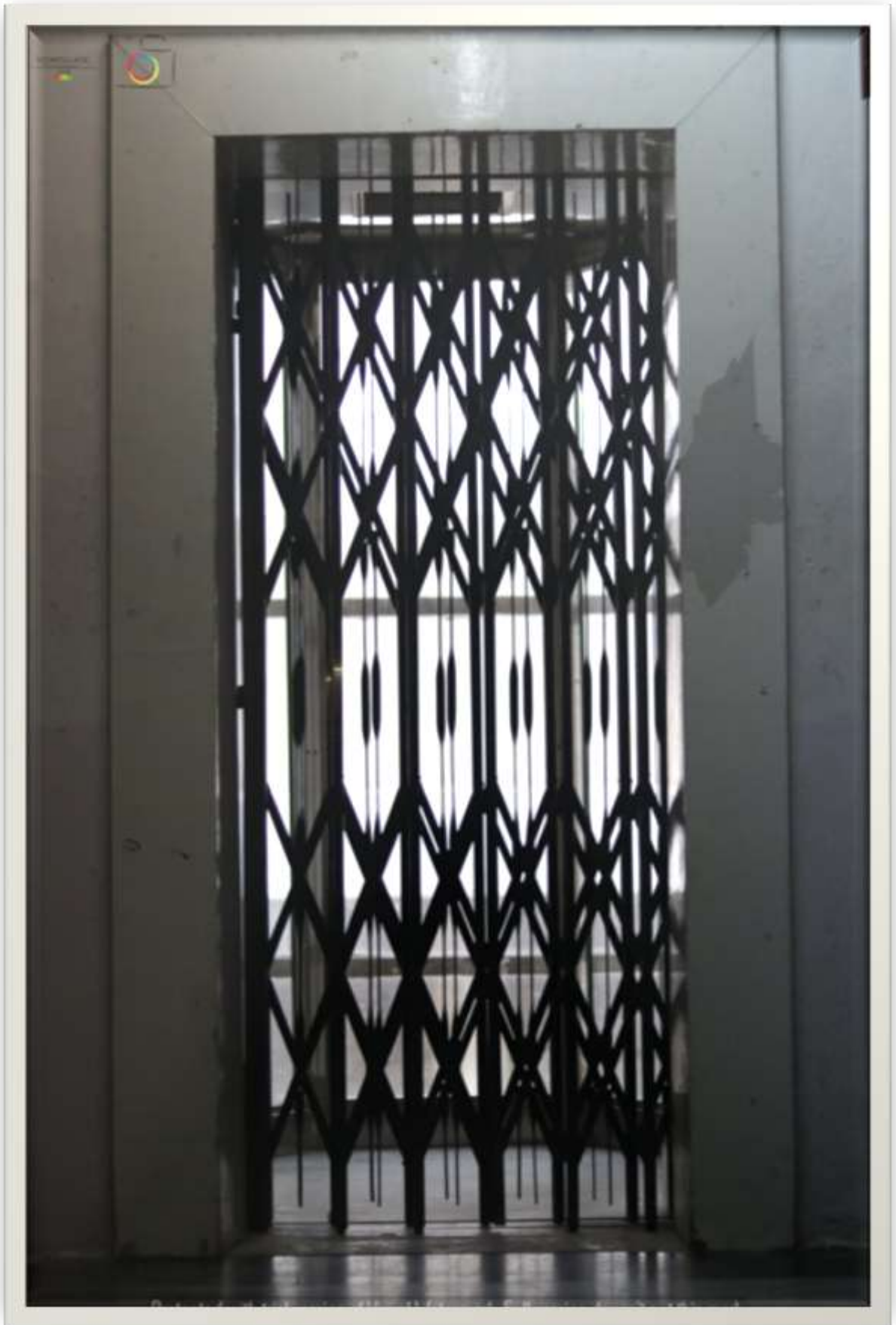
1 Lift in DSSR PG & Research Centre – PG Block