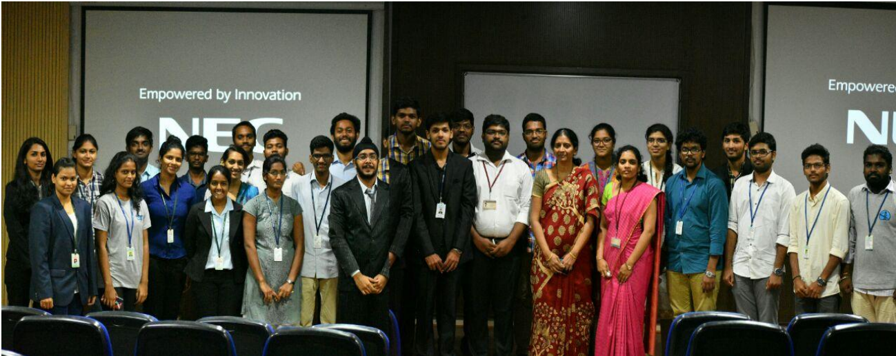
Core Team – ICI & IGBC for the A.Y. 2017 - 2018

Members of ICI had participated in a workshop "ApreCont"- Advances in precast construction technology supported by ICI student chapters On 20 th December, 2015 at Visveswaraya bhavan, Khairtabad.